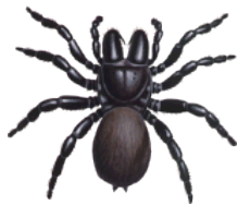
FEMALE MOUSE SPIDER

Often mistake for the funnel web. Lives in ground. Toxic and painful bite