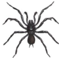
MALE FUNNEL WEB SPIDER

May or may not have a red mark. Prefers dry and sheltered areas under houses, garbage bins, toilets, and rubbish areas.