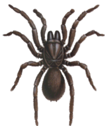
FEMALE TRAP DOOR SPIDER

Commonly mistaken for funnel web spider. Lives in ground. Bites are painful but not toxic