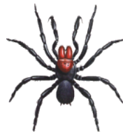
MALE MOUSE SPIDER

Often mistake for the funnel web. Lives in ground. Toxic and painful bite