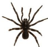
MALE TRAP SPIDER

Commonly mistaken for funnel web spider. Lives in ground. Bites are painful but not toxic