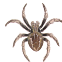
GARDEN ORB-WEAVER SPIDER

Front legs are longer than rear legs. Might cause a painful bite.