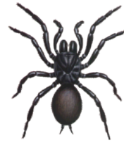
FEMALE FUNNEL WEB SPIDER

Ground dwelling spiders. ACTIVE DURING LATE SUMMER AND AUNTUMN.