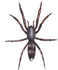
WHITE TAIL SPIDER

Ground dwelling spiders. ACTIVE DURING LATE SUMMER AND AUNTUMN.