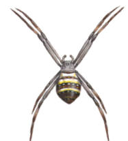
SAINT ANDREWS CROSS SPIDER

Hides in foliage during the day. Seldom bites.