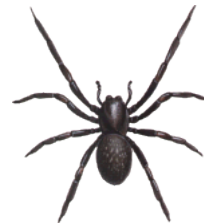
COMMON BLACK HOUSE SPIDER

Roams looking for the female. Toxic and painful bite